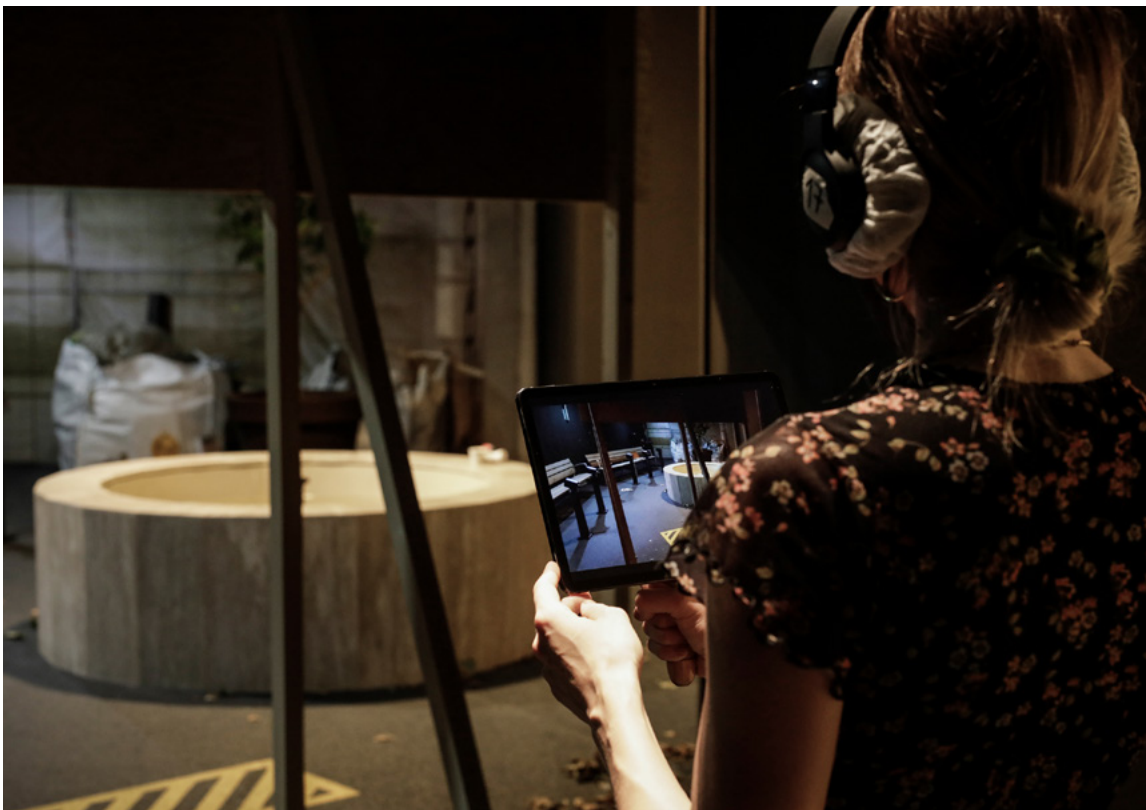
URBAN NATURE FROM RIMINI PROTOKOLL INSTALLATION SHOT