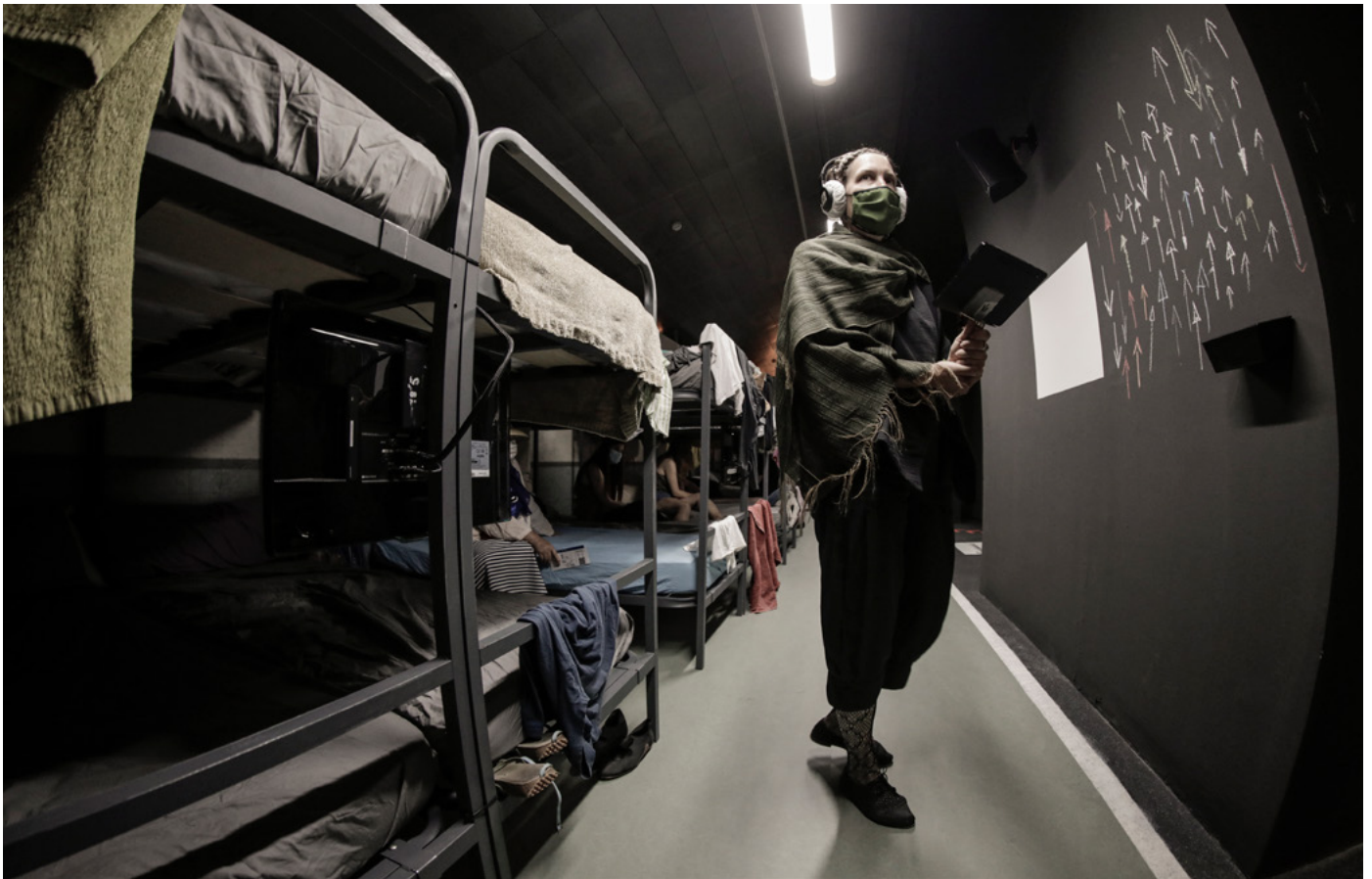
URBAN NATURE FROM RIMINI PROTOKOLL INSTALLATION SHOT